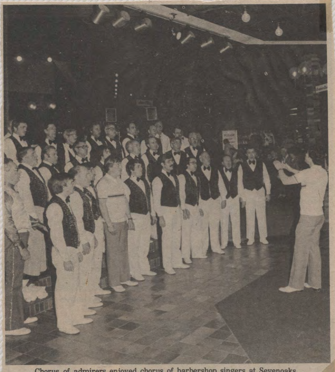
Chorus of admirers enjoyed chorus of barbershop singers at Sevenoaks when First Capital Chorus performed for Friday evening shoppers.