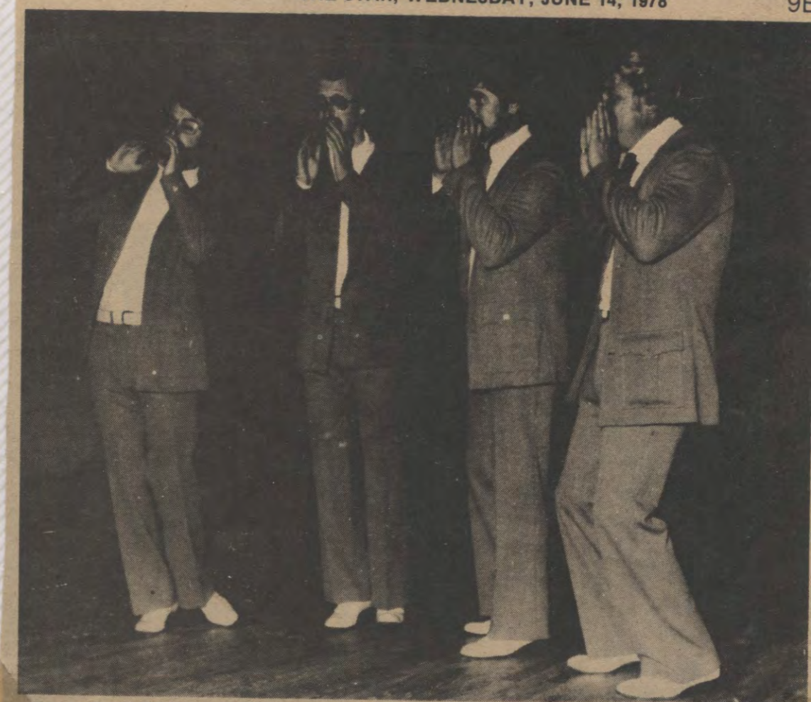
Banquet was treated some old time renditions by