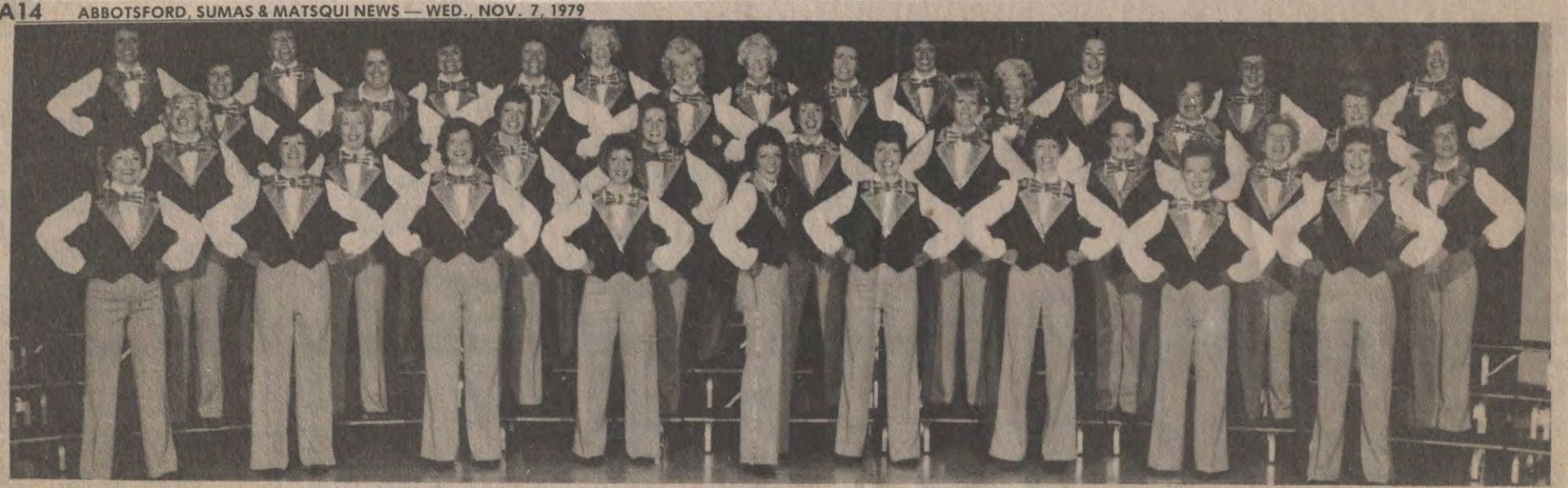
Sweet Adelines sing barbershop-style close harmony at Fraser Valley College, Abbotsford at 7:30 p.m. Tuesday. A men's chorus of Valley barbershoppers will also entertain in the concert, part of Studio Series.