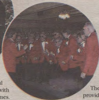
The First Capital Barbershop Chorus provided festive entertainment.

Thanks to everyone who voted for The Langlely Times. The "Newsties" had a fantastic time!