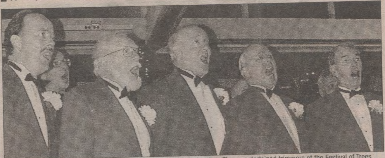
Singing the praises of Christmas, members of the First Capital Barbershop Chorus entertained trimmers at the Festival of Trees.